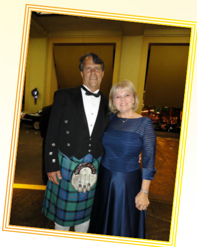
Kilted "VEGAS STYLE"