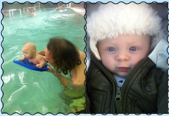
Holden is getting around these days, first it was off to show how well he can swim and next he's out modeling his winter collection of new clothes.